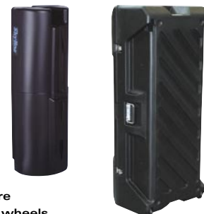
Cases feature handles and wheels.

Skyline Fabric Structures pack in cases that are easy to manage and protect your investment during storage and transport. Most standard models include case!