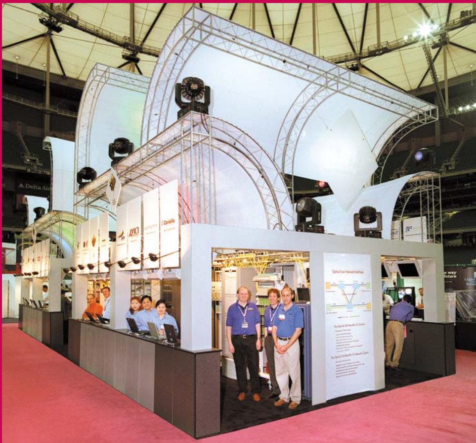
Curved SkyTruss towers are covered with fabric. Mounted spotlights bathe the fabric with color. Structural workstations line either side of the exhibit providing workspace and secure storage.