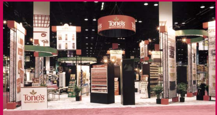
A series of SkyTruss towers feature large fabric graphics and connecting bridges with magnet-applied panels. A hanging Skyline Fabric Structure adds impact.