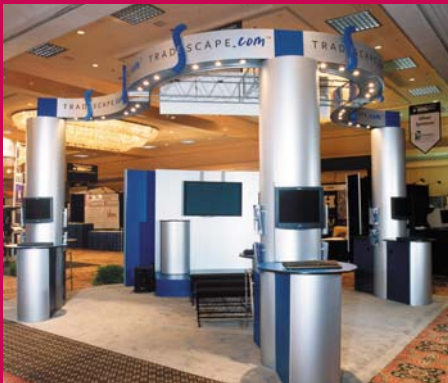
Presentation area includes a stage and SkyTruss bench seating. Bridges incorporate downlighting.