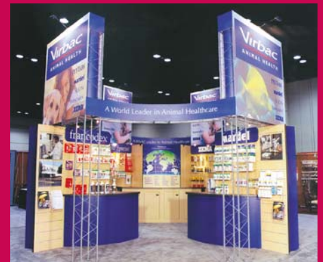
SkyTruss, in conjunction with Skyline ps3000 panel system, creates a great merchandising exhibit.