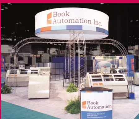
A large Skyline Fabric Structure mounted to a central SkyTruss tower provides a big presence.