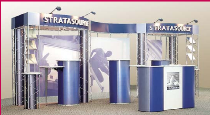
Backwall features large graphics, 3D logos and literature shelves mounted within SkyTruss towers. A variety of matching workstations add workspace.