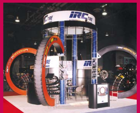
Curved SkyTruss gives this unique exhibit a big presence and the opportunity to display product.