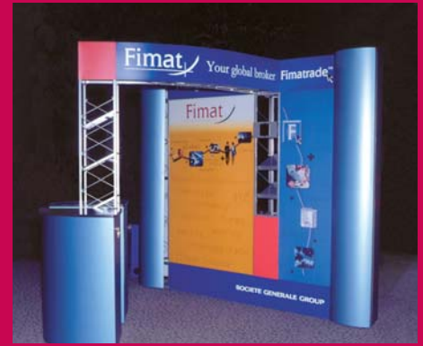
10' backwall includes bridge with magnet-attached graphics, built-in workstation and literature shelves.

Achieve the look that fits your organization. With its built-in versatility, graphic capabilities, and a host of functional accessories, SkyTruss allows you to create exhibits that are unique and effective.