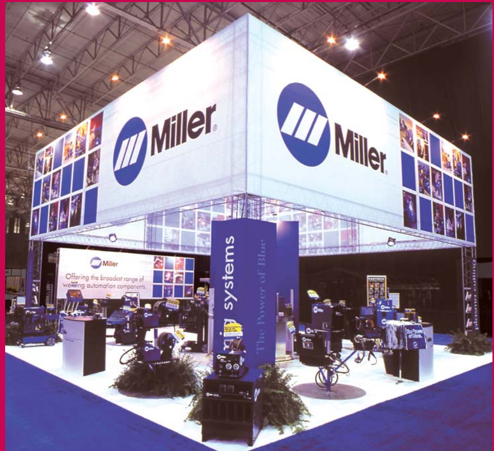
Large fabric graphics carried by SkyTruss gives this company a huge presence without taking up valuable floor space – which is needed for displaying products. Perimeter tables provide workspace.