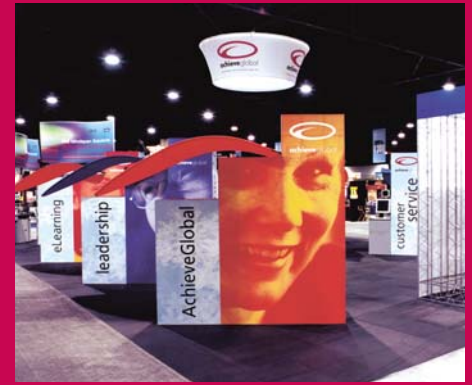
SkyTruss structures carry colorful graphics and fabric canopies. A fabric hanging sign adds impact.