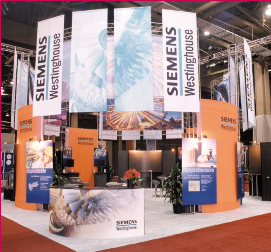
Massive SkyTruss structure brings the company name into view from afar with fabric banners. Vibrant fabric graphics define space and add mass. Workstations provide area for presentations.