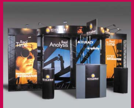
20' backwall features large fabric graphics, integral shelving and matching workstations.